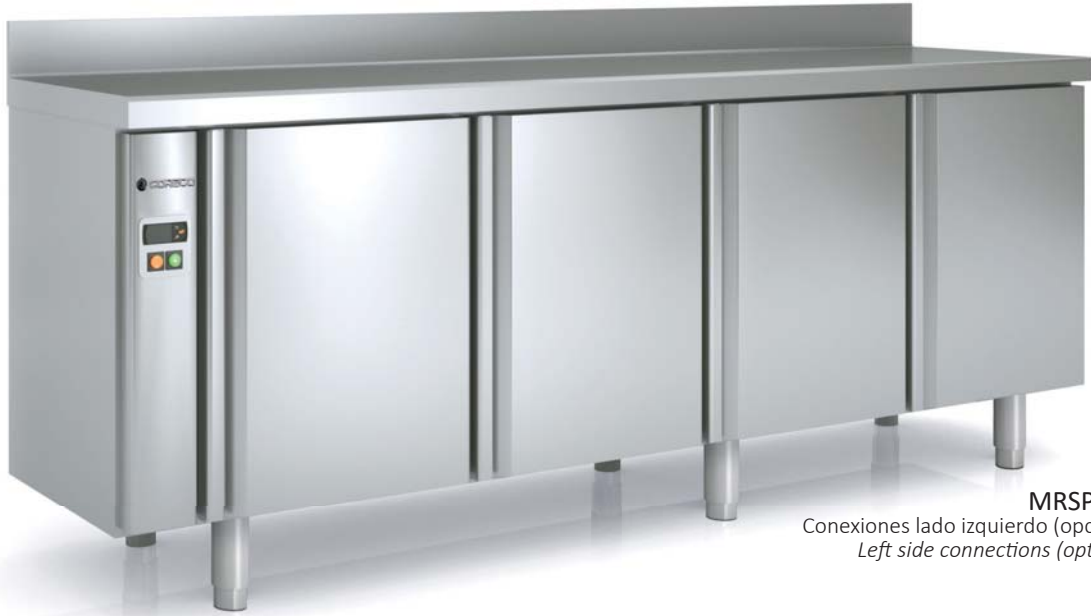
MRSP-220 Conexiones lado izquierdo (opcional) Left side connections (optional)

all photos must be considered as a reference - fotografías no contractuales