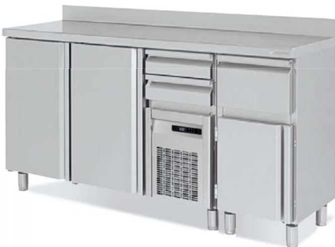
FMR-150 + MCC-50T Encimera especial Special worktop