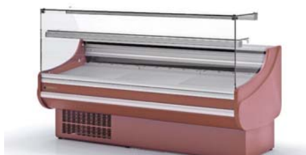
lacado lacquered CVES-9-20-RR