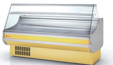
decoración frontal front decor CVES-9-20-R